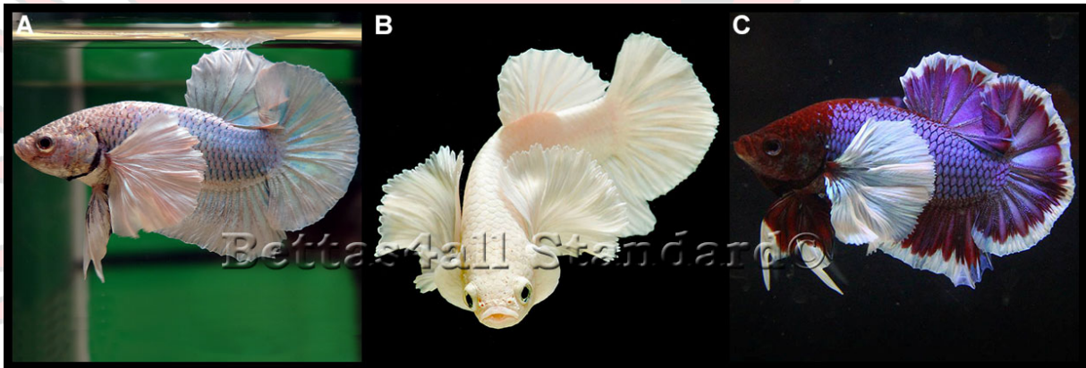
Figure 4K.3 Examples of shortfinned males with large pectoral fins.

As described for all other finnage varieties (see Chapter 3 and Chapter 4A–4J ) in combination with the ideal dimensions (see Paragraph 1.3 and Figure 4K.2 ).