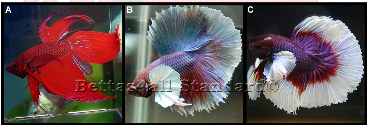
Figure 4K.4 Examples of longfinned males with large pectoral fins.

Please note that these fish are examples and still exhibit points requiring improvement.