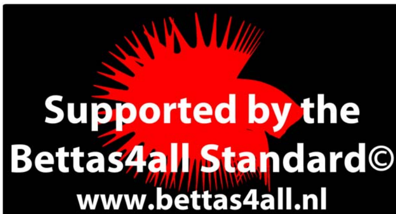
Figure 1C.2 “Supported by the Bettas4all Standard®” logo.

We have designed a special “Supported by the Bettas4all Standard®” logo, which can be used on websites, banners and posters that announce shows will be judged according to the Bettas4all Standard®. The logo currently comes in three different versions (see Figure 1C.2 ).